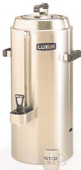
TPD - 3.0 Gallon LUXUS® Thermal Dispenser