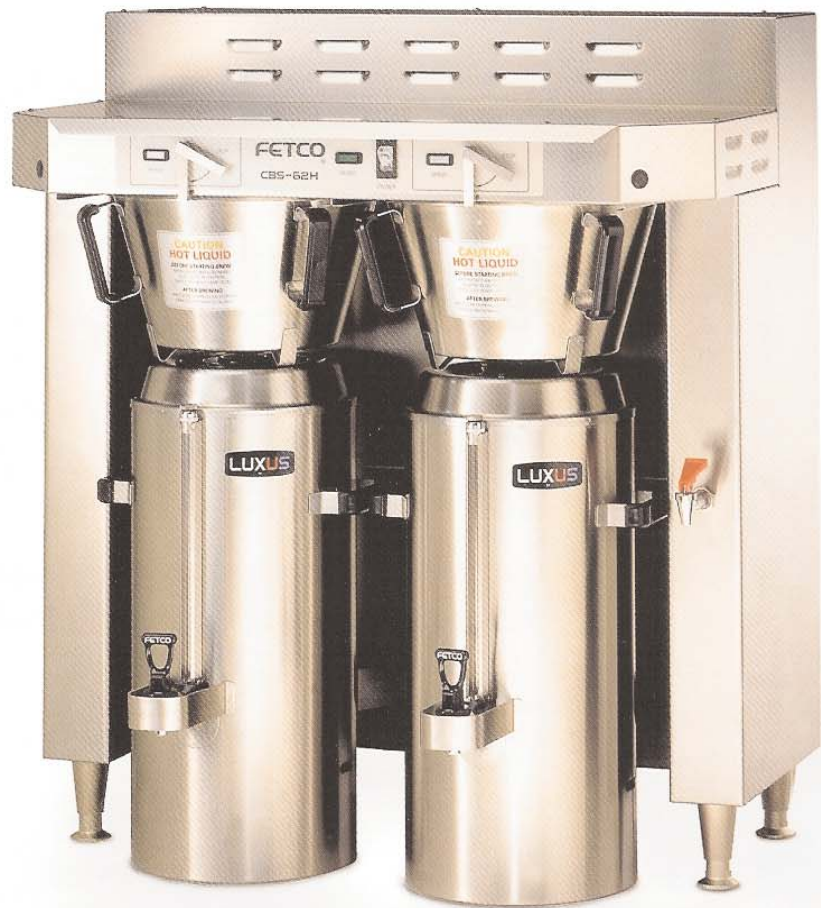
CBS-62H in Stainless Steel Finish and with 3.0 Gallon LUXUS® Thermal Dispensers Dispensers sold separately.

Provides the ultimate in hot and cold beverage dispensing. Totally portable, they require no electric power to maintain temperature. You can prepare them ahead of time. Once filled and capped, they go anywhere. Ready to act as your remote dispensing station wherever needed. Indoors, outdoors, on different floors, or placed throughout a restaurant, hotel or office for hours of fresh hot coffee service. LUXUS® thermal dispensers can be staff operated or used as a self-service system.